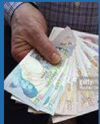
Get the Cash