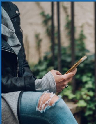
Receive a Text

No Need for Card or Bank Account – Just a Mobile Phone