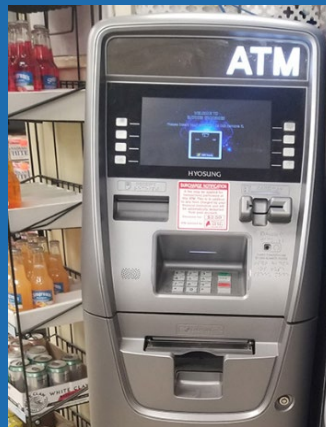
Go to an ATM